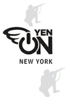
ILLUSTRATION BY Kakao Lanthanum